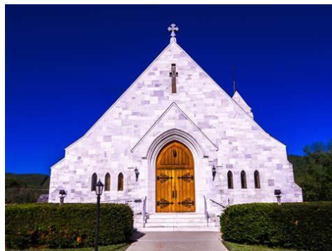
Christians may go to church and pray, Muslims will go to a mosque