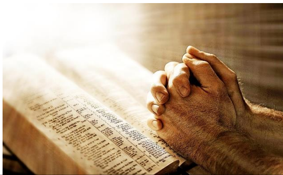
Prayer allows Muslims to communicate with Allah. Christians and Muslims can pray anywhere.