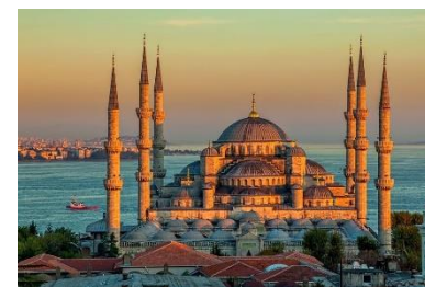
Mosque - A Muslim place of worship